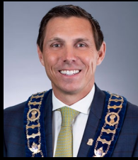
Patrick Brown Mayor

Welcome to Brampton, the youngest and second fastest growing City in Canada.