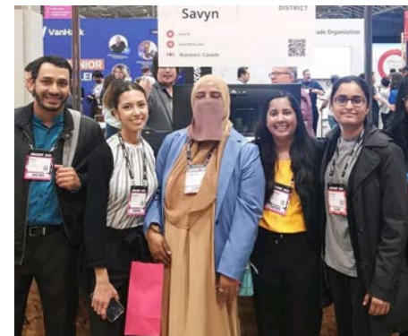
Collision Conference 2023

Brampton Economic Development Office (EDO) has been a key contributor to our success through the support and resources they provided. We exhibited and pitched at Collision in 2023, sponsored by EDO, through which we were able to successfully get an investment from US based VC fund. Thank you for continuously supporting startups and small businesses succeed."