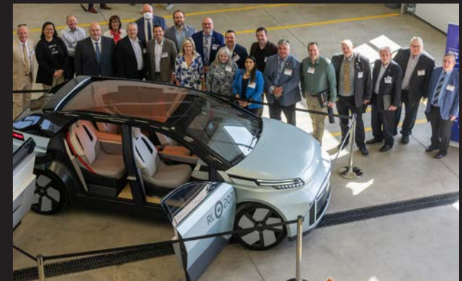
Project Arrow Concept Vehicle

As the industry undergoes transformative change, the Auto Mayors reaffirmed their commitment to work together with industry as a collective group to strengthen the Canadian automotive economy.